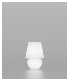
NAXOS LT 33