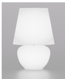
NAXOS LT 76