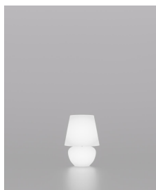
NAXOS LT MN