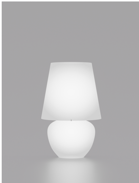
NAXOS LT 50 BCST BC INC CE